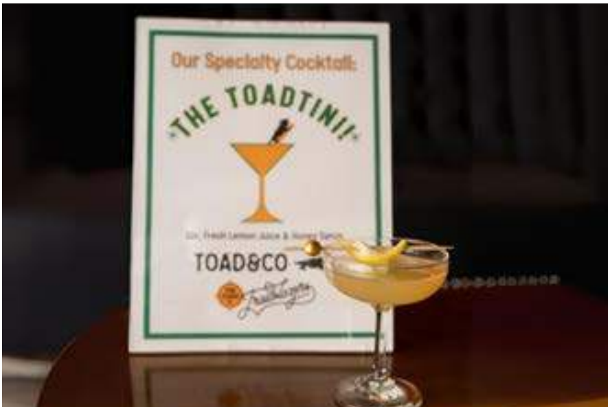
Customized Brand Activations