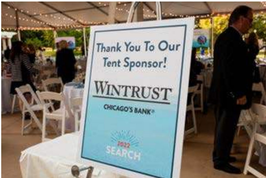
Event Signage with Logo