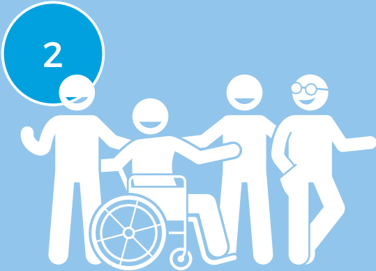
DISABILITY AWARENESS TRAININGS