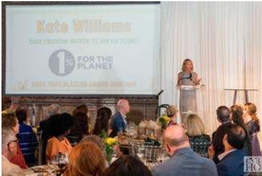
Main Stage and Table Visibility