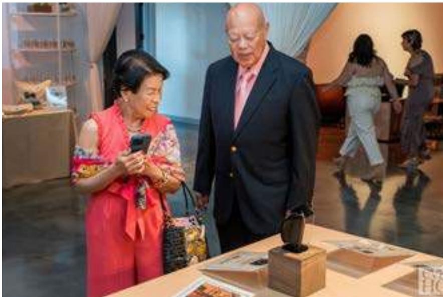
Digital and Print Recognition