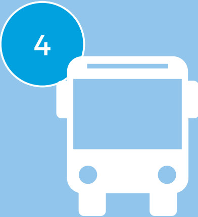
HOP ON THE BUS WORKSHOPS