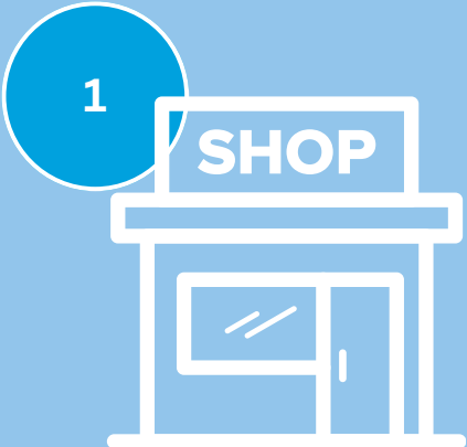
PLANET ACCESS STORE